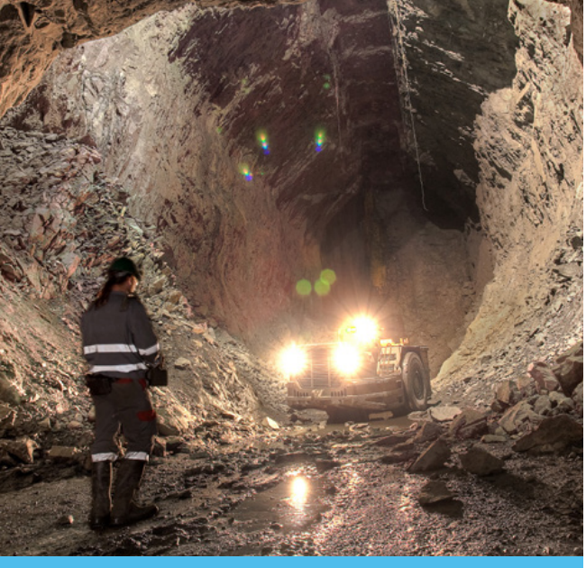
MATSA copper mine, Huelva, Spain

The Group was in compliance with all its corporate and financial covenants as at 31 March 2015.