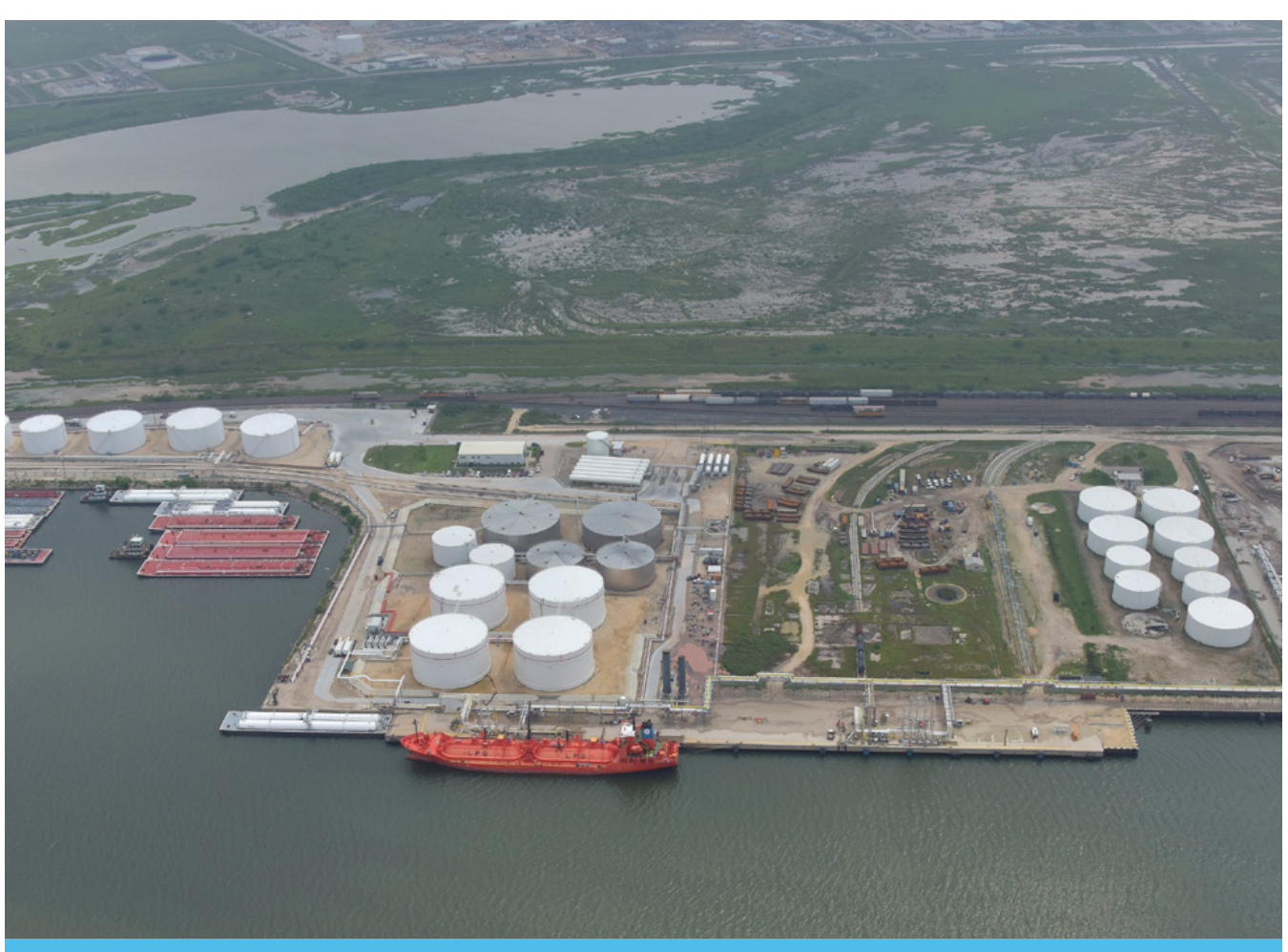
Corpus Christi oil storage facility, Texas, US

Group income tax expense in the period more than doubled to USD136 million, reflecting increased profitability including increased profitability in jurisdictions with higher income tax rates.