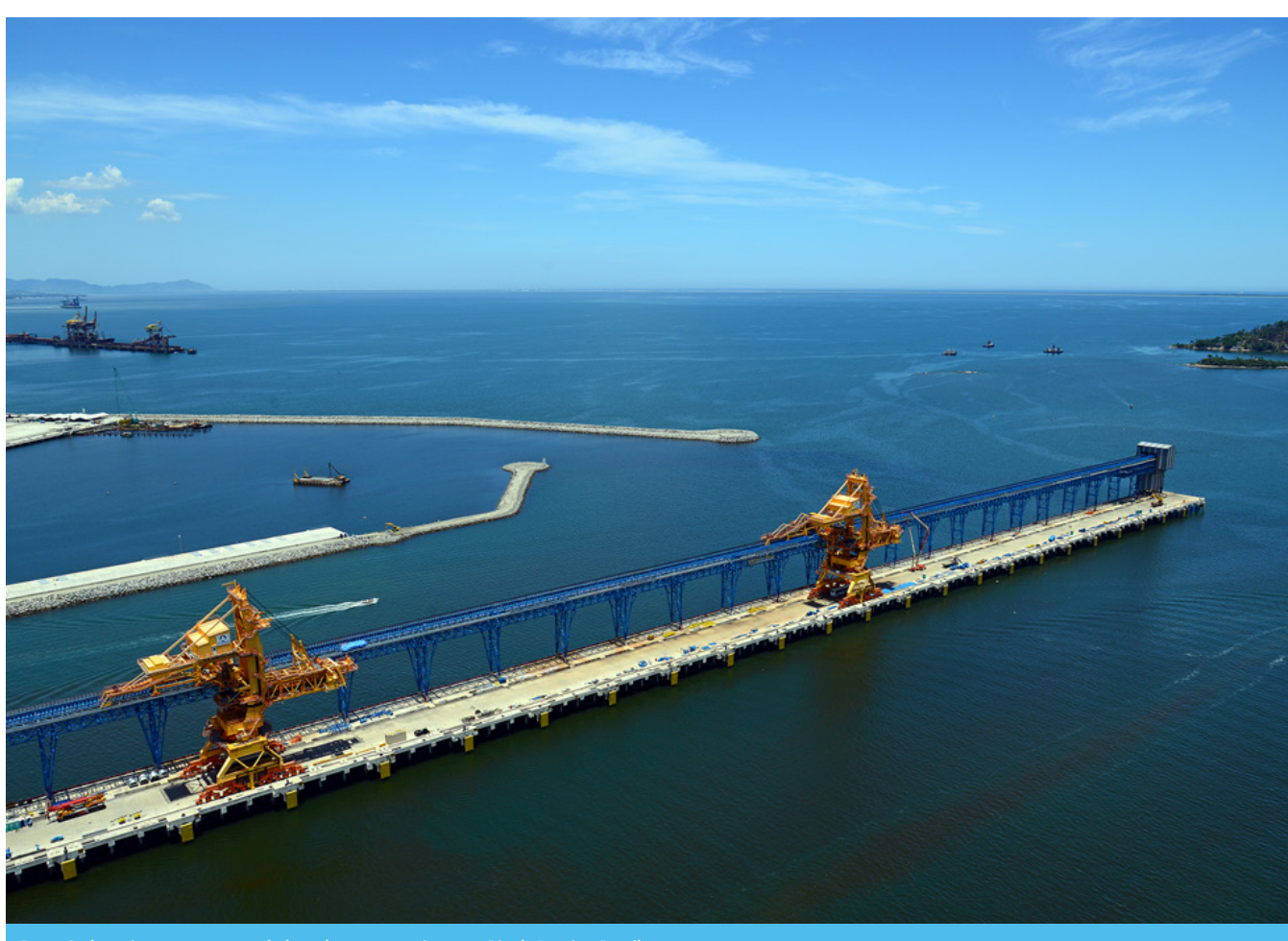
Porto Sudeste iron ore conveyor belt under construction near Rio de Janeiro, Brazil